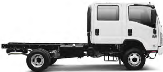
NPS 300 Crew